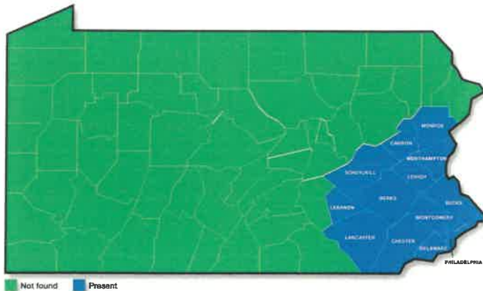
Figure 2. The distribution as of September 20, 2018, of SLF in Pennsylvania, indicated in blue. Check the Pennsylvania Department of Agriculture's website for updated distribution information.

An SLF quarantine is currently in effect for 13 counties in Pennsylvania (Figure 2). If you find a spotted lanternfly, kill it and report it immediately with our online reporting system at extension.psu.edu/spotted-lanternfly or by calling 1-888-4BAD-FLY (1-888-422-3359).